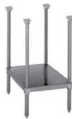
95-6060 S/S Stand