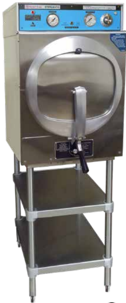
Shown on optional stand 95-6060