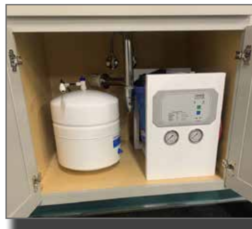
Easily fits underneath a standard counter sink