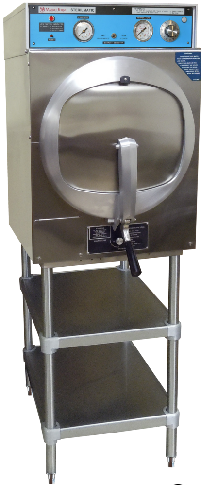
Shown on optional stand 95-6060